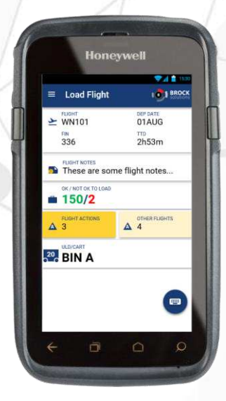
SmartLoad Load Integration screenshots on the web client and handheld terminal and Cargo Reconciliation screenshot on handheld.