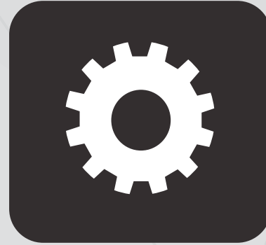
BATCH + SEMI CONTINUOUS