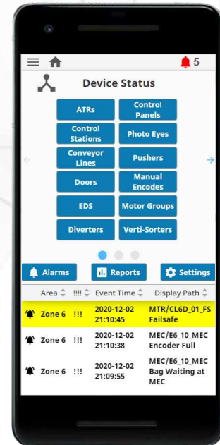
Screenshots of the Advanced BHS Map module on the web client and Mobile HMI on mobile to access the BHS network remotely.